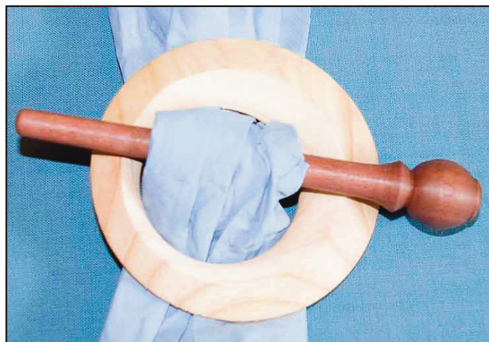
▲ The finished brooch and pin.