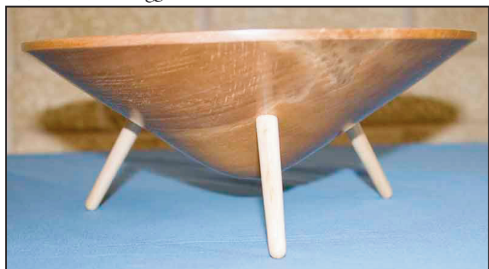
▼ The three-legged bowl

Once the bowl and legs were completed and assembled, he moved on to his second project, a brooch and pin to hold a shawl in place. He started the project by making the eccentric jig to hold the ring part of the brooch, then used this to make the brooch itself, finishing off with the simple spindle-turned pin.