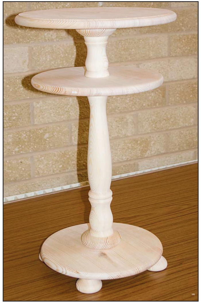
▲ The finished table

His second project was a spiral candlestick, also in pine - and he demonstrated how to lay-out, cut, rasp and sand the spiral and the tools he used to do this.