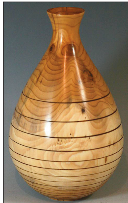
The finished yew vessel.

Les took the session immediately after lunch and showed how to make a hollow, narrow-necked, vessel from a yew log the easy way - by hollowing it in two parts, and gluing it back together once the hollowing was finished. This avoids having to hollow out through the narrow neck. Les disguised the join with burned grooves. Unfortunately there was a crack in the piece of yew, so he took the project home to finish it off with CA glue and copper powder in the crack.