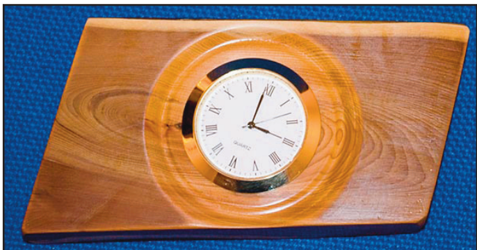
Watch insert fitted into the small yew plank.

He finished the day by showing how he prepares and roughs a yew fork to become natural edge bowl with wings.